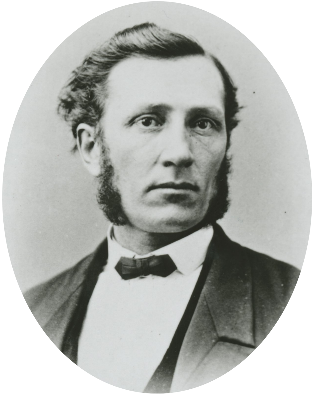
Figure 2: Joseph F. Smith circa 1873.